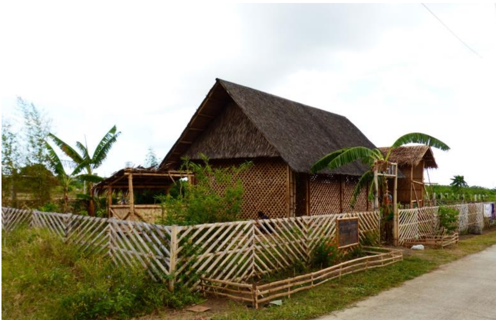
The landscape of the Training Room prototype is changing everyday. It is becoming a real showcase of the LP4Y Youth's talents !

The Youth of Green Garden and Eco-construction have continued this month their successful collaboration on building the dry toilets prototype. The absence of Green Garden team during one week to attend a seminar about organic farming slowed down a bit the rythm but it is going on the last steps. The construction of the human waste area below the building is beginning.