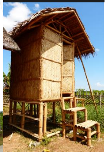
The entrance door and the front wall are finished !