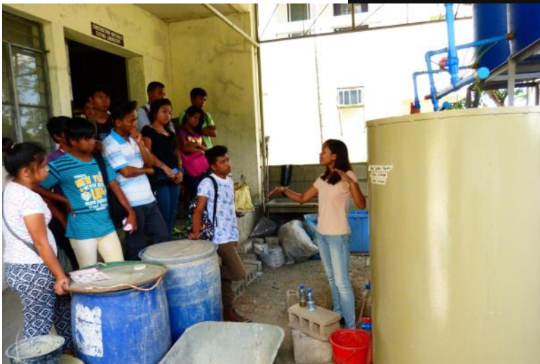
The student explaining the experimentation set up and its results. She reached to provoke multiple questions from the Youth who showed a real interest for the test going on!