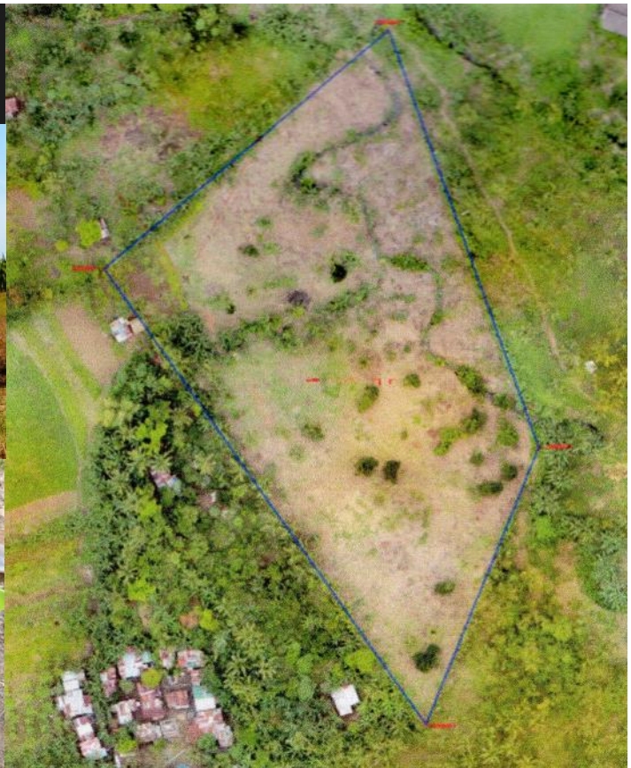
The official boundaries of Green Village!