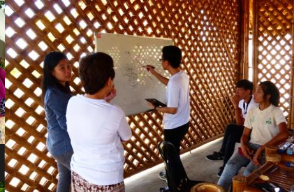
Exchanges about the Site Development Plan