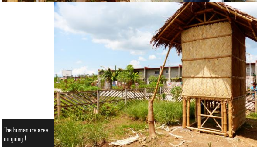
The humanure area on going !