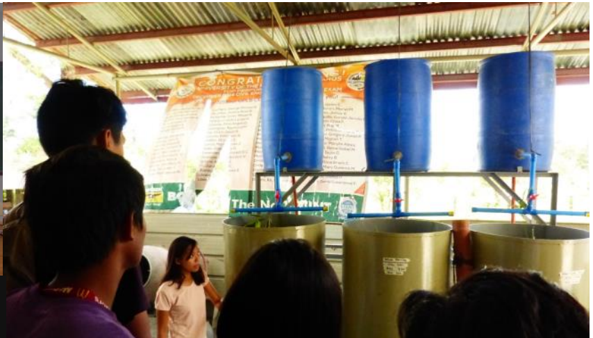
The small scale constructed wetland testing different low-cost or reused medias combined to filtering plants (like bamboo in the first set-up) to find the best results in terms of nitrogen and phosphate removals.