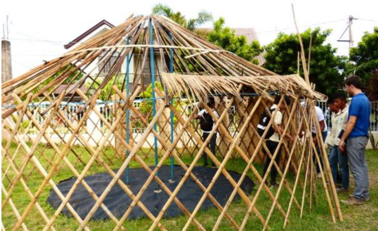
The Eco-construction team discovering the bamboo foldable yurt design of SHOLUTIONS.