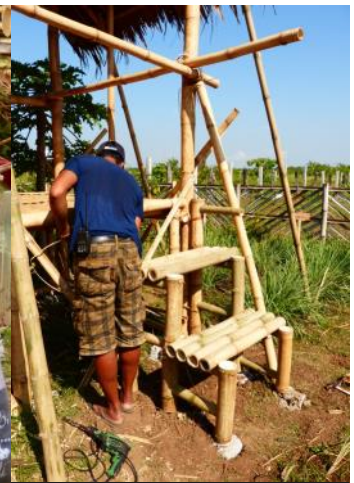
Installation of the stairs in bamboo