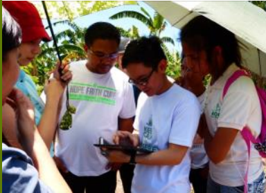
Bornes recognition on site during the second design team meeting