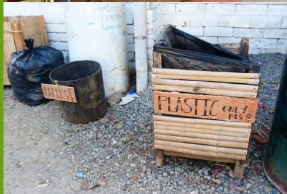
It is a real challenge here, in Southville 7, but the Youth are carrying on their intempt to push the Community to sort their garbage.