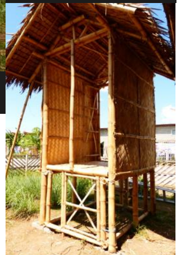
Beginning of the doors : the entrance door and humanure area door (to remove the future bucket of human waste).