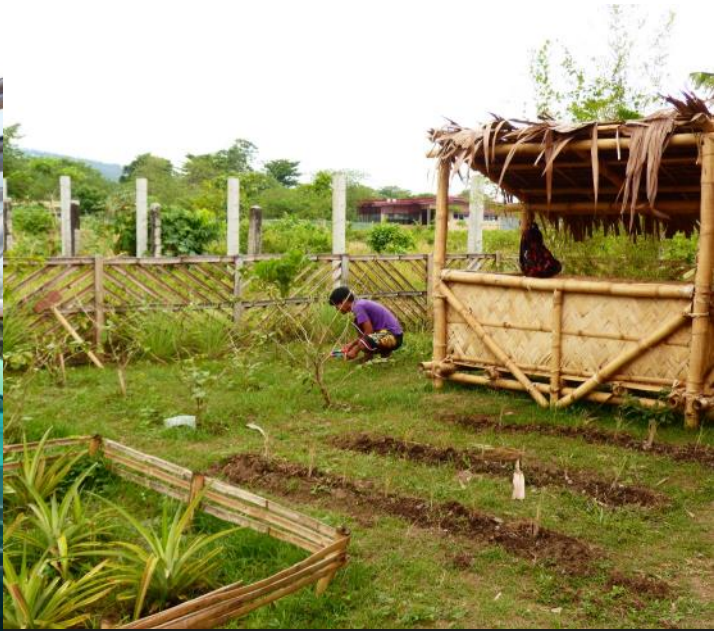
Alvin, cleaning the garden around the Training Room prototype.