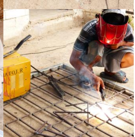
After that, Loudimer welding each letter of LP4Y and GREEN VILLAGE on the grids. Good job !