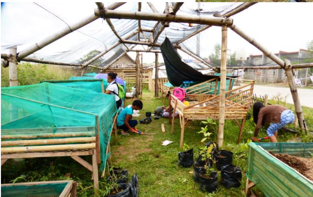
All the Green Garden is mobilized to clean and organize the greenhouse.