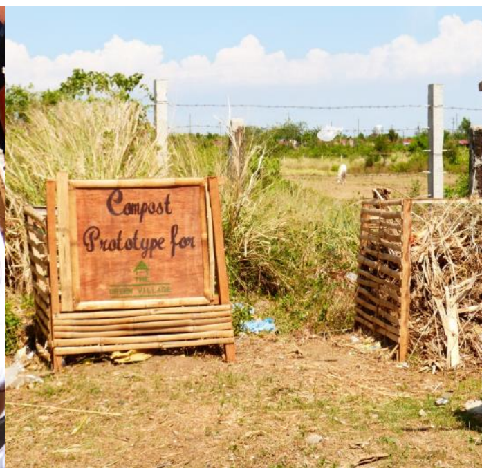
Jonalyn, a Youth of the Green Garden, who designed and painted the new board of the compost area.