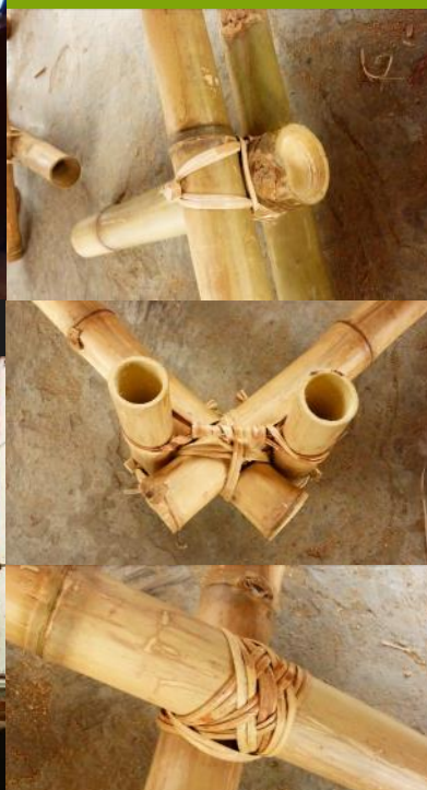
3 of the 7 bamboo joints made by the Youth.