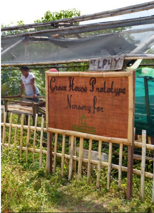
The new panel of the Greenhouse of the Green Garden created by the Youth.