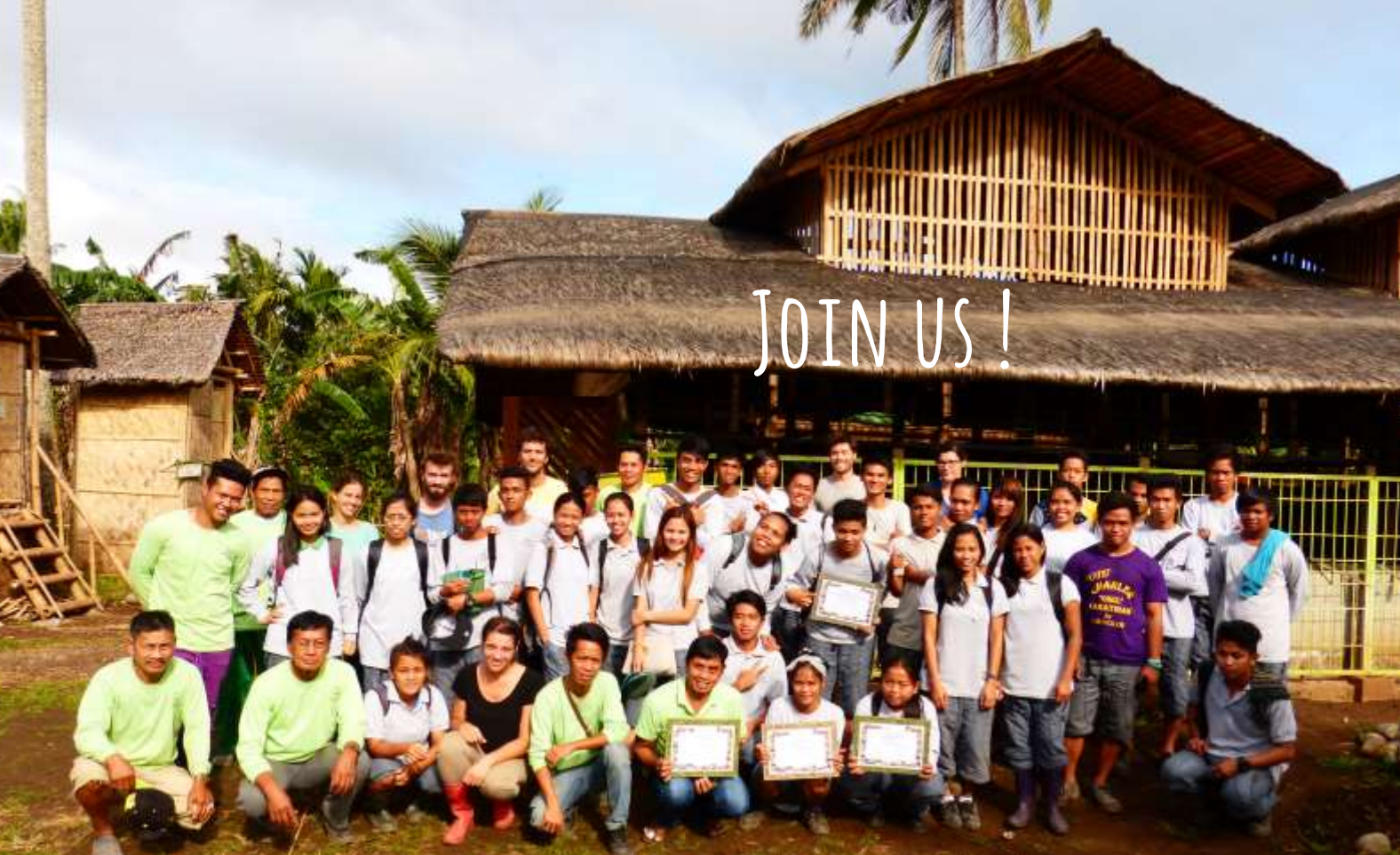
The three Green Village teams in Calauan, Philippines, January 2017